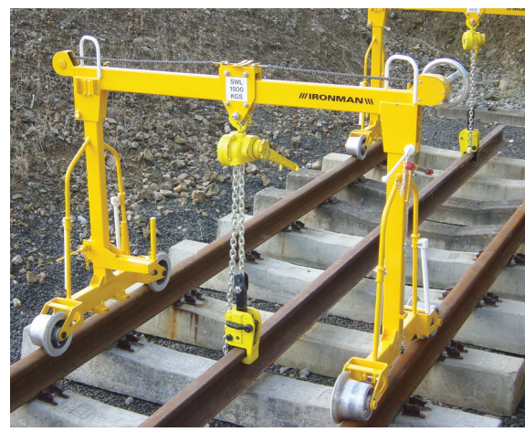
Typical application shot showing a CR1000 in use with a Yale D85 Pul-lift and an 'Iron man'.

Clamps can be supplied with a short length of chain and lifting eye as shown in the illustration. This MUST be specified at the time of order.